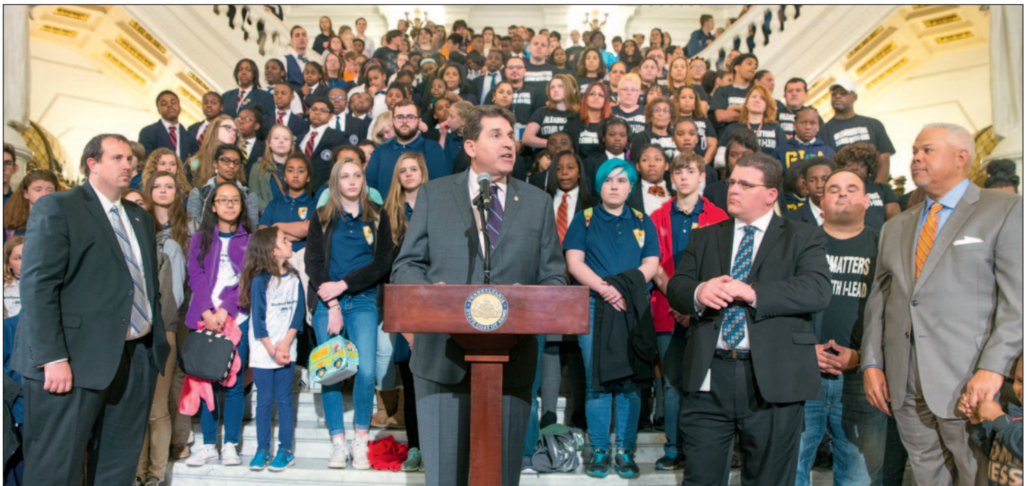
Senator DiSanto speaks at an education rally at the Capitol.