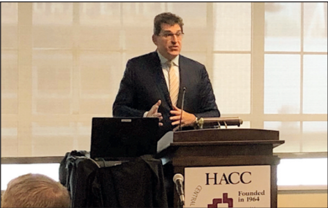
Senator DiSanto discusses key legislative proposals to strengthen Pennsylvania’s economy and create jobs at a business forum in May.